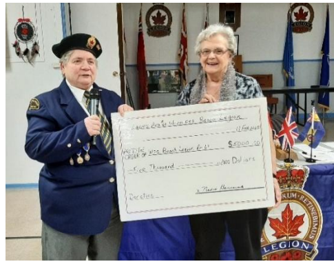
Donation to the Branch from the Ladies Auxiliary!

"You are braver than you believe, and stronger than you seem, and smarter than you think"